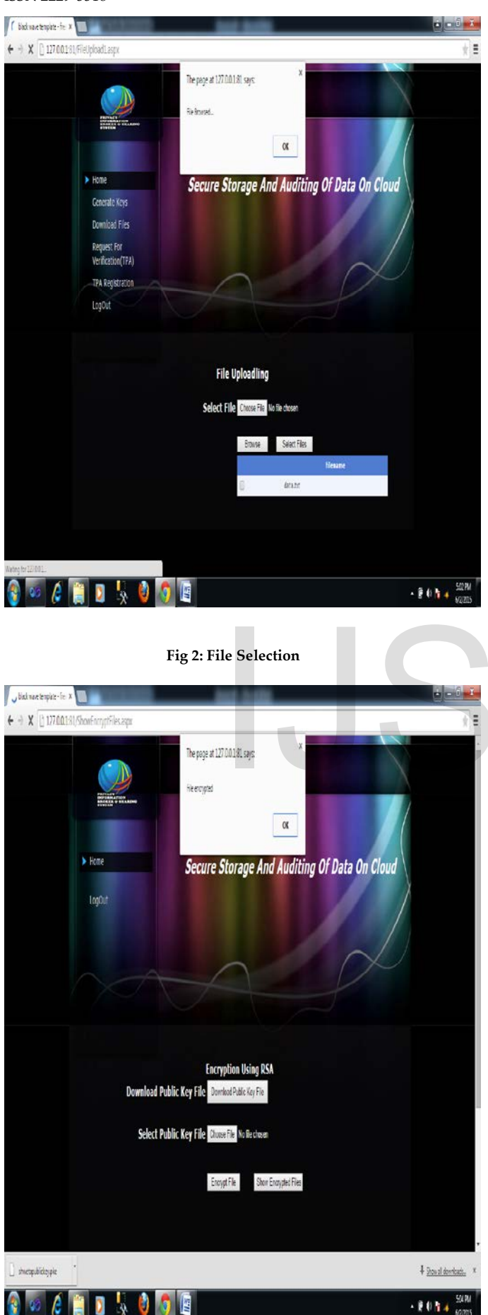
Fig 3: File Encryption

International Journal of Scientific & Engineering Research, Volume 6, Issue 6, June-2015 ISSN 2229-5518