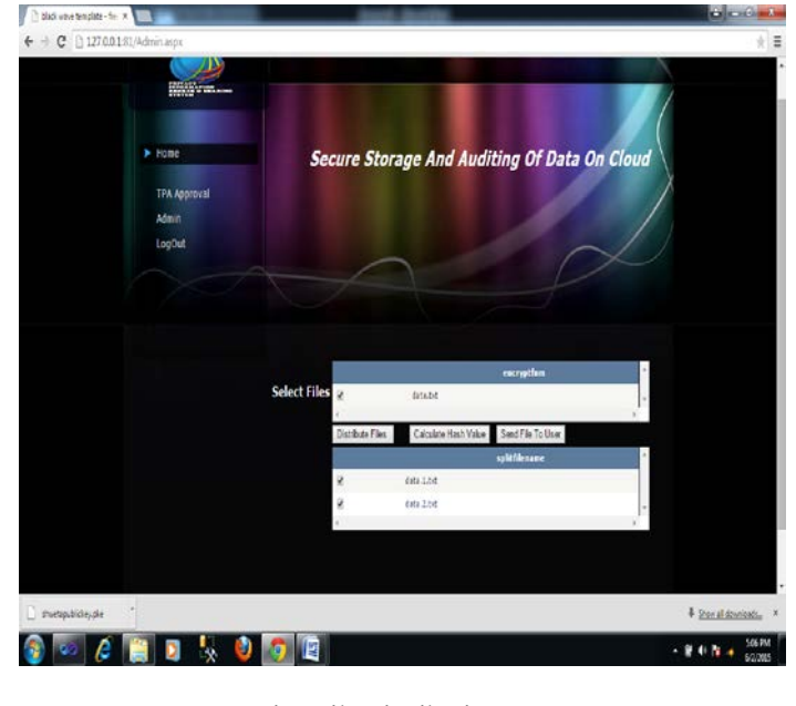
Fig 4:File Distribution